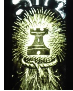
Wheat sheaf with tower

There is a wheat sheaf with a tower superimposed on it . After the death of C. E. Kempe, his cousin Walter Tower took over the business and added his mark, a picture of a tower. The feathers of the angel wings might have come from a peacock . Peacocks are also typically used symbols of the glass designer Kempe and can be seen in other churches.